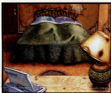
Creating screens for Lost in L.A. was a three-step process. First, an artist handpainted a background, using oils on canvas.