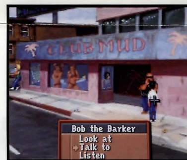
"Lost in L.A.'s" new point & click interface alleviates frustration without sacrificing richness of gameplay.

With lessons learned from the original user interface used in Search for The King , and from consumer feedback about other graphic adventures on the market, an entirely new, simple point-and-click interface was developed. "You select anything on screen,